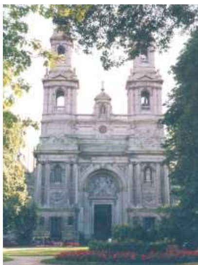
The largest church owned by the SSPX: Saint Joseph's Church, Brussels, Belgium

On 12 January 1937, one million people were present at the funeral of Brother André (9 August 1845 – 6 January 1937), who built the largest shrine to Saint Joseph in the world in Montreal, Canada.