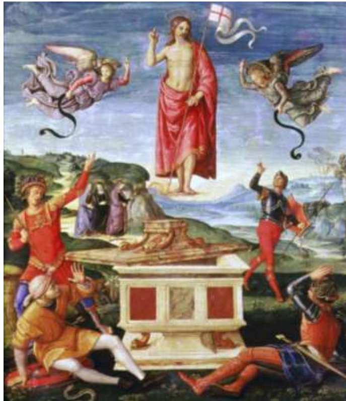
The Resurrection of Christ Raffaello Sanzio (1501-1502)

(Archbishop Fulton Sheen, Lent and Easter Wisdom, 110)