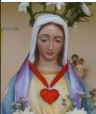
Consecration of the SSPX faithful in Sri Lanka to the Immaculate Heart of Mary 8 December 2013

Knock is a village where Our Lady appeared in 1879. On the day of the visit, it was the first time ever that an SSPX priest