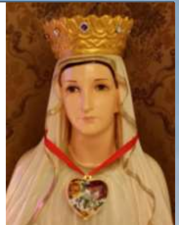
All the names of the SSPX faithful in KL, Malaysia, were placed in the Immaculate Heart of Mary on 31 May 2015

Among the many graces received, I will just mention another one. A lady was to lose her job on the 4 March 2010 which was going to be tough on her family. Jobs were scarce in Ireland after the 2008 economic downturn. On the day she agreed for her name to be placed in Our Lady's heart, she received a phone call; it was an offer for a job starting on the... 4 March!