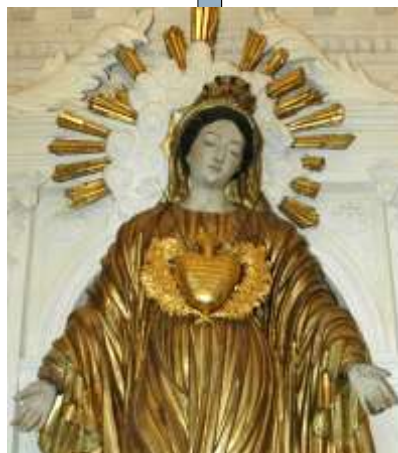
Ars: the statue of Our Lady with the heart in which the holy Cure placed the names of his parishioners

was able to say Mass publicly and officially in the church of the apparitions. Since then, the SSPX can hold in Knock its national pilgrimage every year.